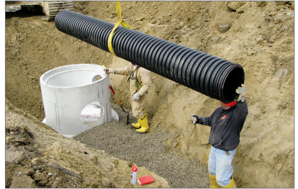
Photo illustrates single sling handling used for the smaller diameters, sloped trench walls to mitigate against the need of a trench box, and stone bedding above the trench foundation.

This guideline does not attempt to address installation practices common to all pipe types (e.g. line and grade, working in an upstream direction), but only those features that are important in securing pipe support from the embedment material. Consistent with that objective, no attempt is made herein to address safety concerns associated with the installation of corrugated HDPE pipe or underground construction in general. It is the responsibility of the user of this guide to establish appropriate safety and health practices and determine the applicability of regulatory limitations prior to use.