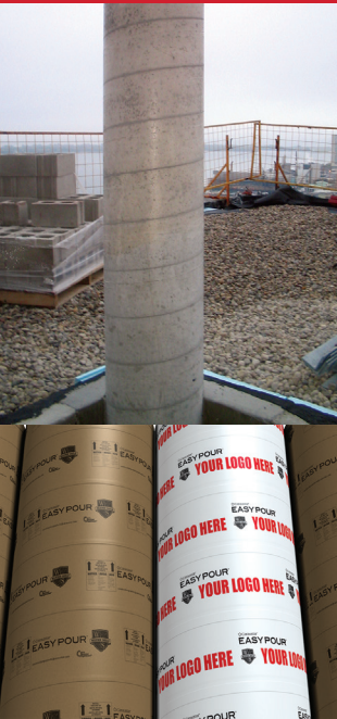
Private Labeling – Your logo available for maximum advertising and visibility on job sites

Caraustar® Easy Pour™ Weather Shield Concrete Forming Tubes – One of the most extensive production networks in the construction marketplace as well as one of the most extensive in all product lines!