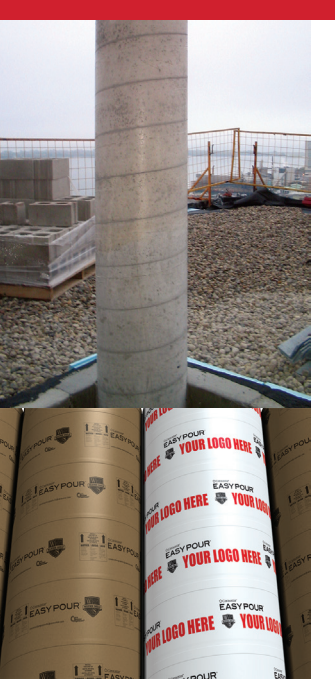
Private Labeling – Your logo available for maximum advertising and visibility on job sites

Caraustar® Easy Pour™ Weather Shield Concrete Forming Tubes – One of the most extensive production networks in the construction marketplace as well as one of the most extensive in all product lines!